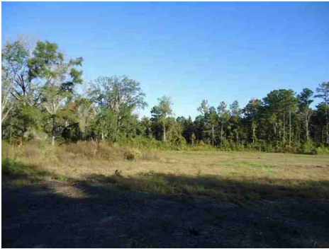
Rear of main site area