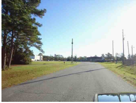
Frontage on Industrial Park R.