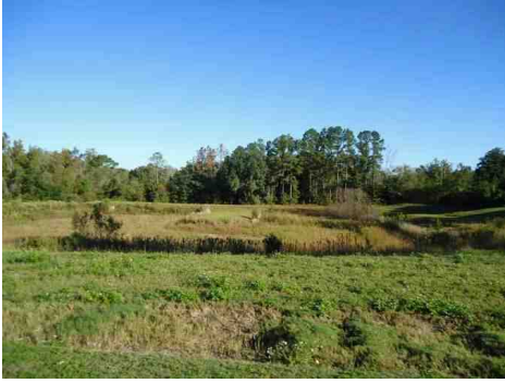
Retention Pond(not included)