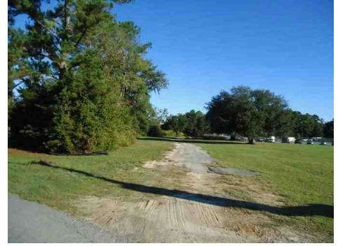
Drive-way off of Industrial P.